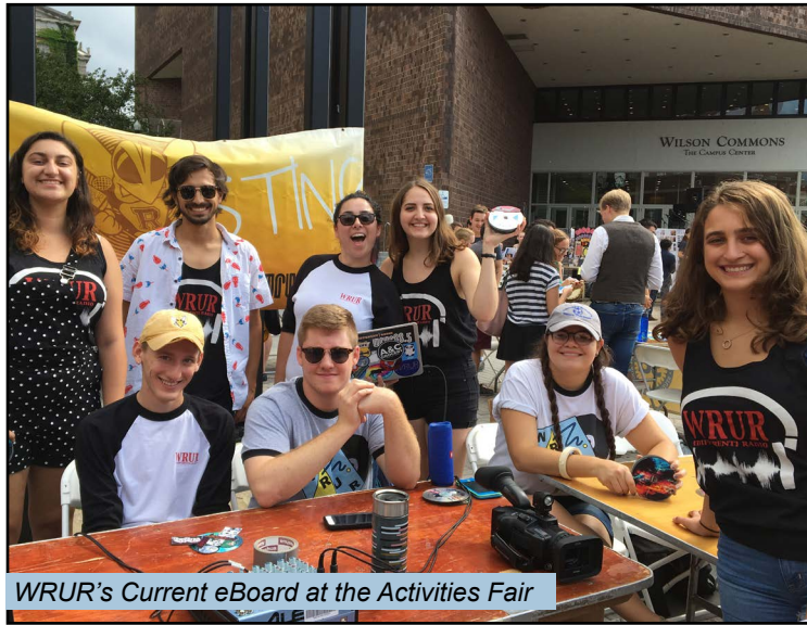
WRUR's Current eBoard at the Activities Fair