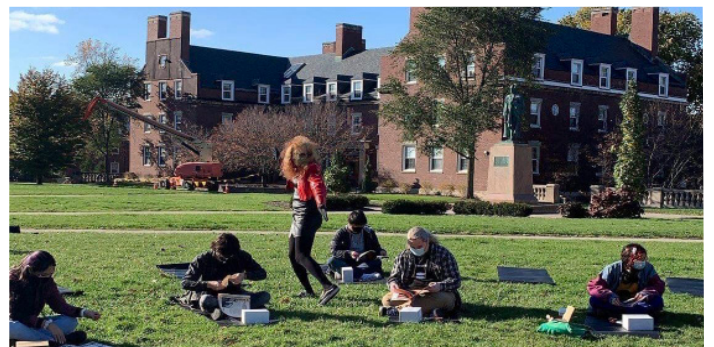
WRUR members at our Trick or Beats event held this October, decorating boxes filled with CDs on the beautiful Wilson Quad

As the fall semester is coming to an end, we are looking forward to next semester. Several members have expressed interest in our developing podcast program, which will hopefully see some recording beginning in the spring. Many more new members are excited to be trained, and we can't wait to see what opportunities will come for the department.